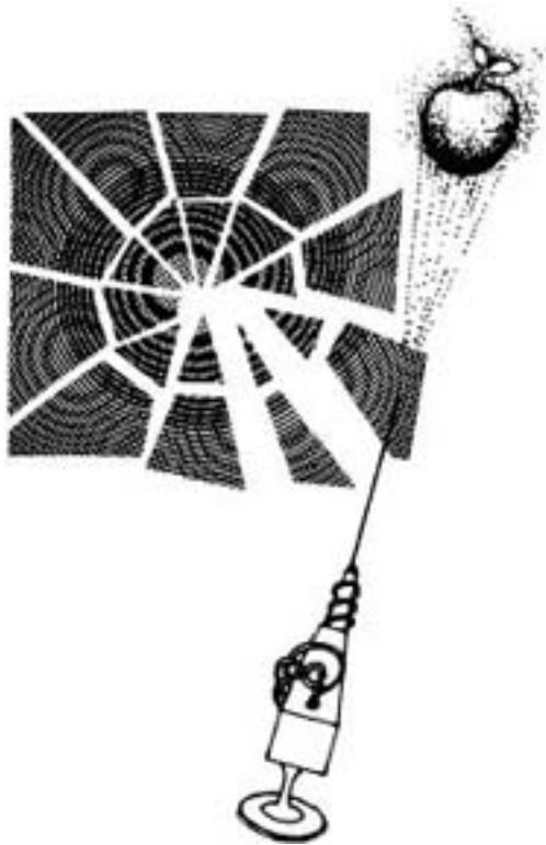
Figure 2. Unlike normal photographs, every portion of a piece of holographic film contains all the information of the whole. Thus if a holographic plate is broken into fragments, each piece can still be used to reconstruct the entire image.

gram) describes a level of reality that is not accessible to our senses or direct scientific scrutiny.